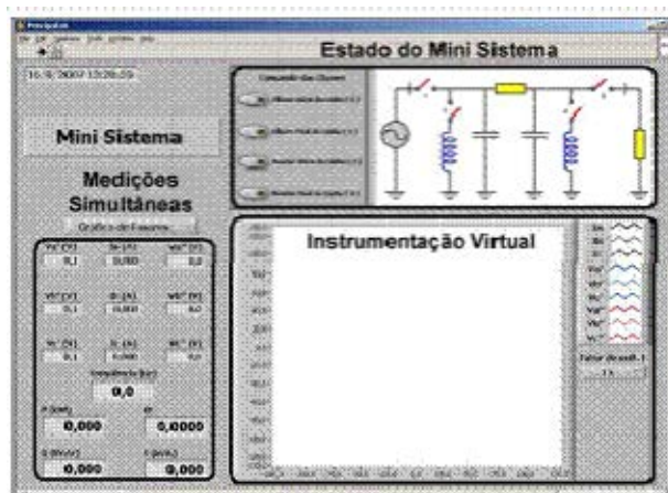
Figure 3. Block Diagram of Mini System

With the goal of using the APF methodology for estimating the size of a software, will be considered an application shown by Lopes (2007), concerning the development of a Supervisory System using LabVIEW Software for Acquisition, Processing, Display of Signals and Storage Signals of a Power Mini System, which we evaluated the following interfaces: Simultaneous Measurements, Mini System State and Virtual Instrumentation, according as Block Diagram of “Fig 3”.